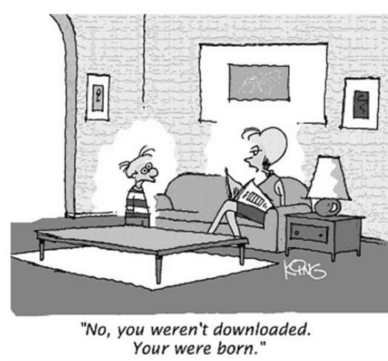
Figure 1. A typical figure

Figure and table captions should be centered if less than one line (Figure 1), otherwise justified and indented by 0.8cm on both margins, as shown in Figure 2. The caption font must be Helvetica, 10 point, boldface, with 6 points of space before and after each caption.